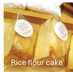
Rice flour cake